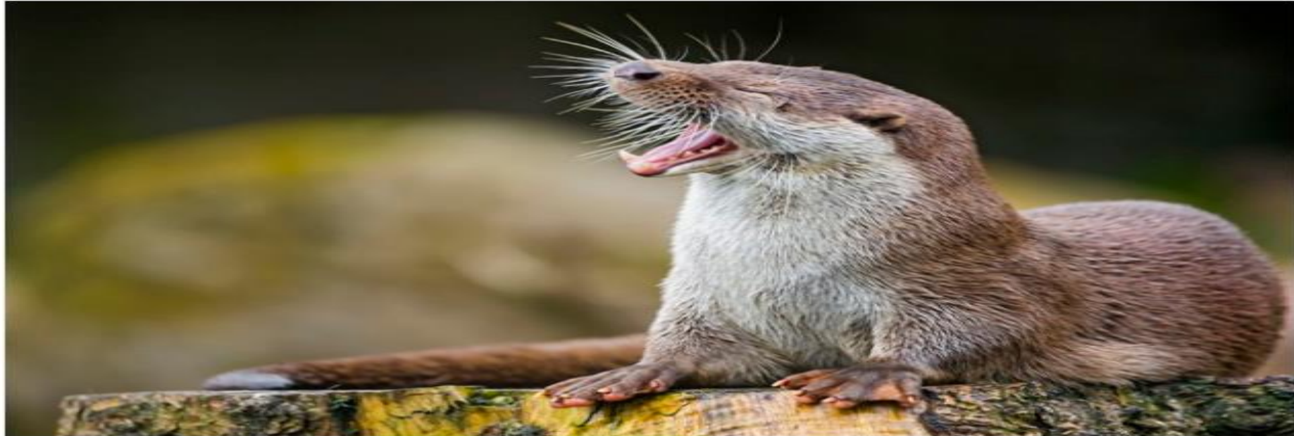
This otter is (probably) not laughing about the British Medical Journal.

Every year the British Medical Journal publishes an issue of joke science. But years later, those papers are cited as real.